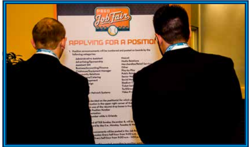
Attendees review the Applying for a Position signage at the 2013 Baseball Winter Meetings

The PBEO Job Fair gives clubs the opportunity to post available positions, conduct interviews and hire qualified candidates through this streamlined and simple hiring process. Clubs can post jobs at the Job Fair free of charge and can pre-post positions on or before November 21 by 5:00 p.m. EST via www.PBEO.com . Attendees can search jobs ranging from internships to full-time positions, then apply, interview and receive offers all while at the Baseball Winter Meetings and PBEO Job Fair. With December marking the height of the baseball hiring season, this is a great way for clubs to get a jump start on the season by filling their staffing needs. Approximately 400-500 jobs are posted each year for between 450-550 job seekers. Don't miss out on the chance to find your next employee from a pool of national candidates. Your club can post available positions in advance of the Baseball Winter Meetings by using your club's account at www.PBEO.com , or by filling out the Job Fair Posting Form on the following page.