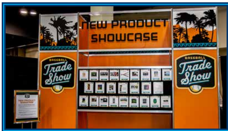
2013 Baseball Trade Show New Product Showcase board

Baseball Trade Show attendees range from owners and general managers to stadium operations and buyers. Representatives from all across Minor League Baseball and Major League Baseball will be in attendance. This annual gathering gives you the opportunity to make purchases for equipment, player apparel, retail merchandise and promotional items and services or to just check out the latest baseball products available on the market.