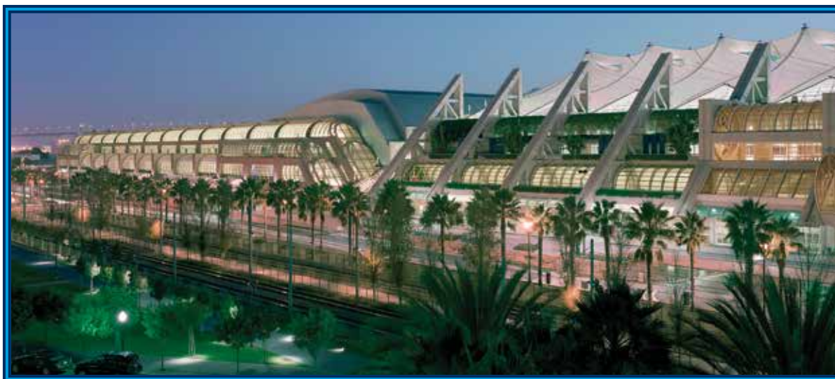
San Diego Convention Center

*Indicates event will take place at San Diego Convention Center. Otherwise, the event will take place at the Hilton San Diego Bayfront, with the exception of the Gala at Petco Park.