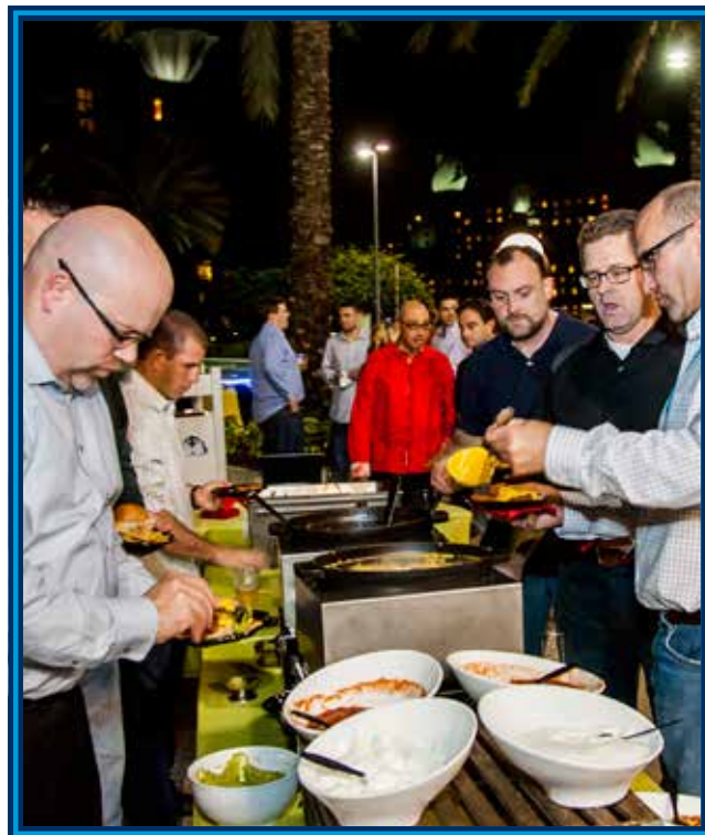
Attendees line up for food at the 2013 Baseball Winter Meetings Gala

Sponsored by New Era Cap Co., Essensa, Rawlings and K&K Insurance Group, the Gala's laid-back atmosphere and casual social setting offers Baseball Winter Meetings attendees, Baseball Trade Show exhibitors and job seekers a chance to network and socialize beyond the week's scheduled meetings. Taking place at Petco Park, this year's Gala will provide an evening full of delicious food, cocktails and mingling among your peers and colleagues, along with a spectacular inside look at the home of the San Diego Padres.