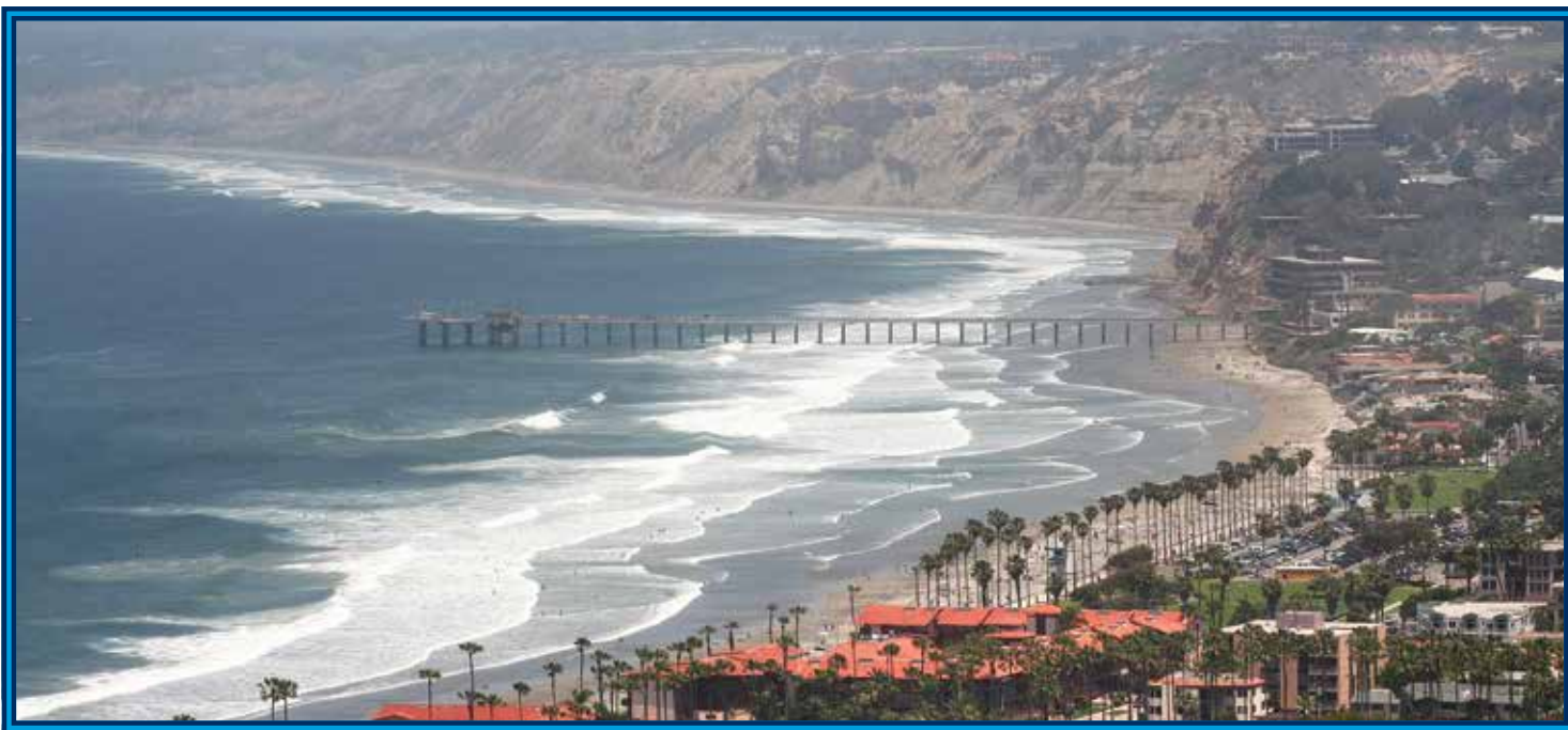
A view of LaJolla Shores