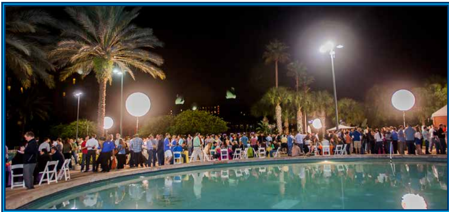
Gala attendees at the 2013 event held at the Walt Disney World Swan and Dolphin Resort