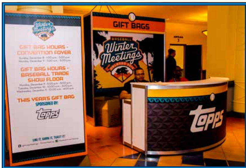
MiLB staff members assist attendees at the Baseball Winter Meetings Information Booth (left); 2013 Baseball Winter Meetings Gift Bag Distribution Counter (right)