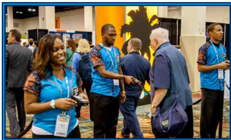
2013 Baseball Trade Show entrance

For complete information on the Baseball Trade Show, including a list of exhibitors and accompanying booth numbers, visit www.BaseballTradeShow.com . The Baseball Trade Show can be reached at TradeShow@MiLB.com or (866) 926-6452.