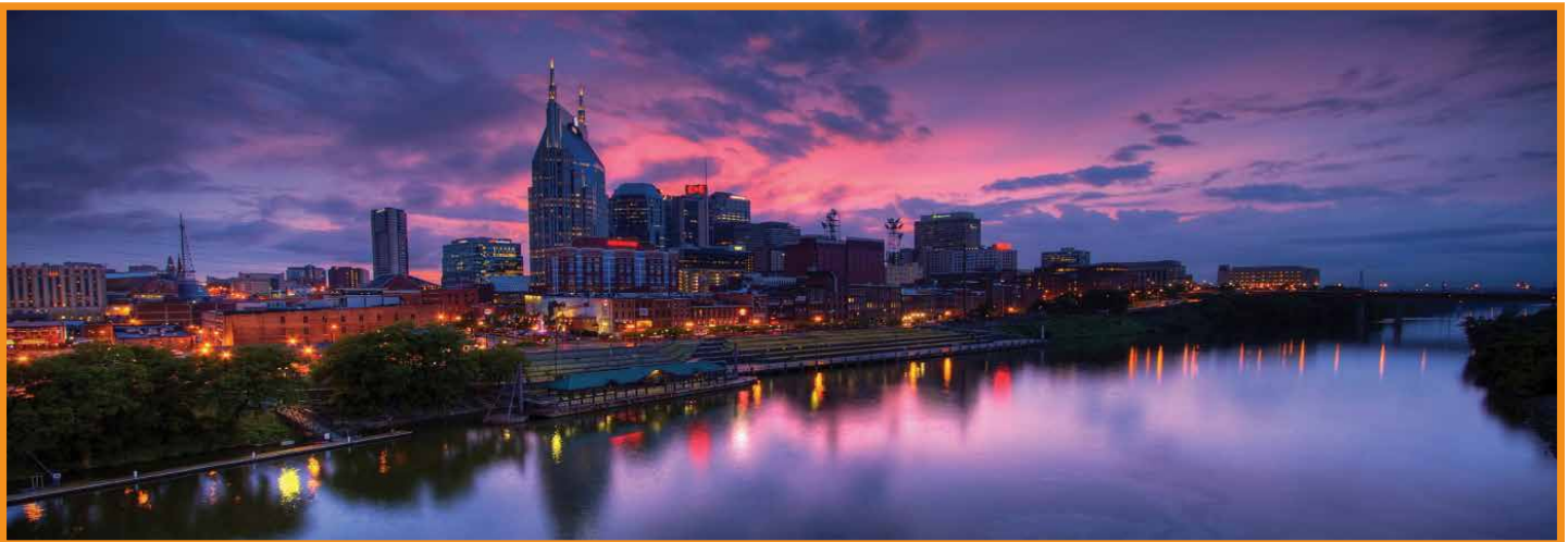
Nashville skyline

For the latest Baseball Winter Meetings information, including the schedule of events, visit www.BaseballWinterMeetings.com .