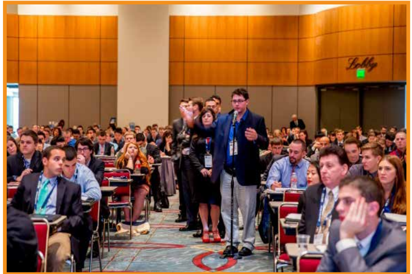
A Job Fair attendee asking a question to the 2014 Business of Baseball panel.

The PBEO Job Fair, presented by DeVry University, gives clubs the opportunity to post available positions, conduct interviews and hire qualified candidates through this streamlined and simple hiring process. Clubs can post jobs at the Job Fair free of charge and can post positions in advance of the Baseball Winter Meetings at www.PBEO.com or by filling out the Job Posting Form on the following page, on or before 5 p.m. ET, Nov. 13, 2015. Job seekers can search jobs ranging from internships to full-time positions, then apply, interview and even receive offers during the Baseball Winter Meetings and PBEO Job Fair.