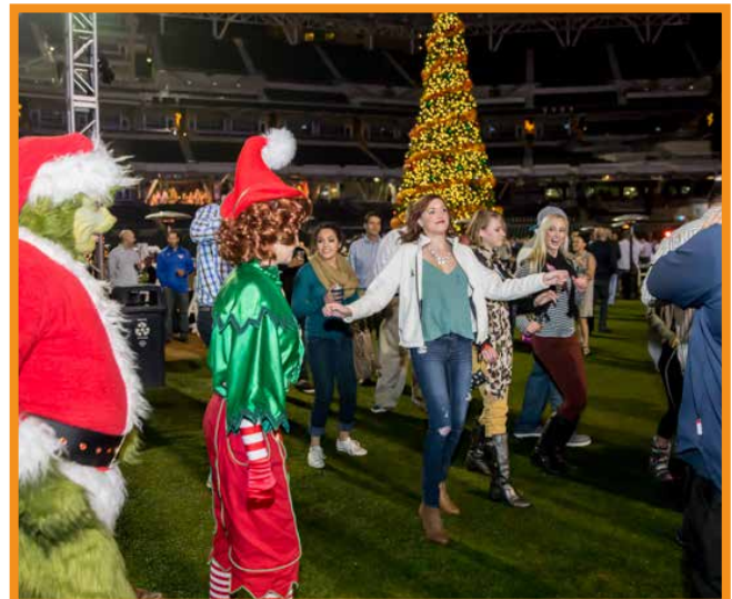
2014 Gala attendees having a great time at Petco Park.