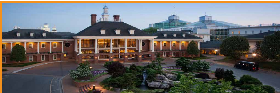
Gaylord Opryland

All events, with the exception of the Gala, will take place at Gaylord Opryland Resort & Convention Center.