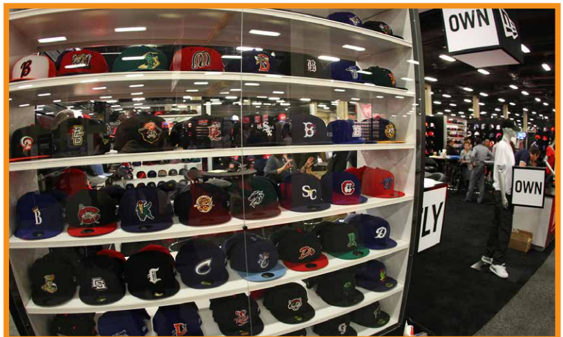
2014 Baseball Trade Show Exhibitor Display

While on-site, make sure to pick up a complimentary Baseball Trade Show Buyer's Guide to help you navigate your way through the exhibits on the trade show floor and stop by the Social Media Lounge to complete an attendee survey to receive a free gift.