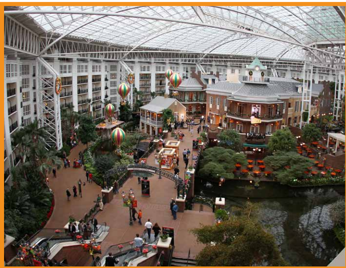
Gaylord Opryland Resort & Convention Center

The cancellation policy at Gaylord Opryland Resort & Convention Center is 72 hours prior to arrival.