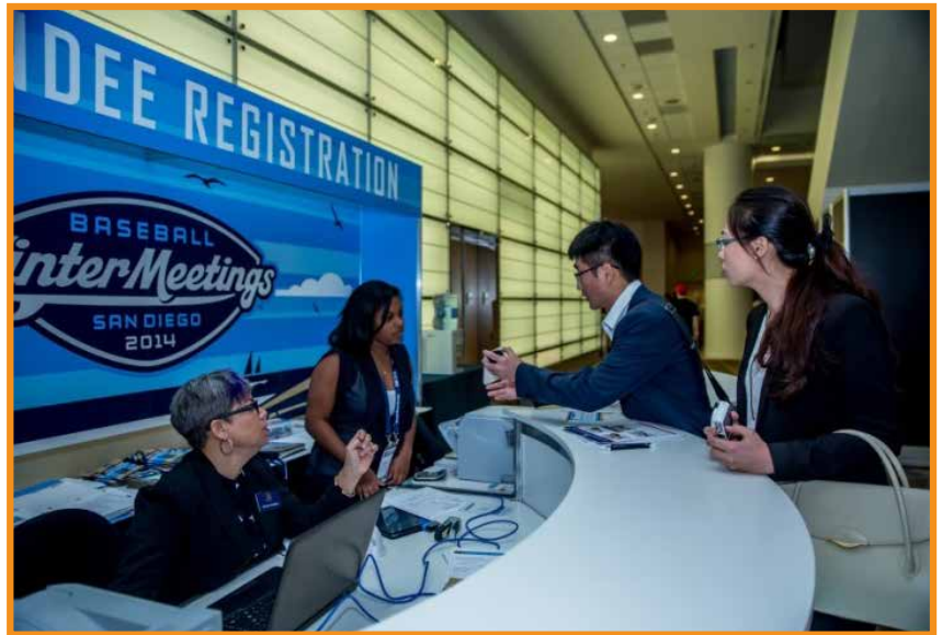
MiLB staff members assisting attendees at the 2014 Baseball Winter Meetings Registration Counter.