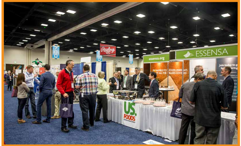
Attendees browse booths at the 2014 Baseball Trade Show.

(Job Seekers will not be allowed access from 1 p.m. – 4 p.m.)